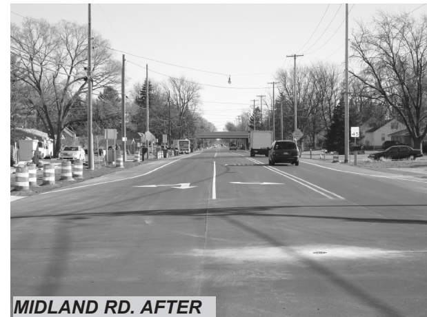
MIDLAND RD. AFTER

This year marked the first year of the BCATS Transportation Improvement Program (TIP) for the fiscal years of 2011/12/13/14. The program includes approximately $84.5 million in transportation and transit projects that will be completed over the four year period. It lists all of the federally funded transportation projects within the Bay City Area that will enhance the safety and efficiency of the transportation system, from I-75 reconstruction to Bay Metro Transit bus replacement to transportation enhancement projects. The 2011/14 TIP was initially prepared by BCATS staff during 2010 with input from the local implementing agencies (Bay City, Bay County Road Commission, Bay Metro Transit Authority and Essexville), MDOT, the Federal Highway Administration (FHWA), and the public and has been amended since for the addition or adjustment to various projects. The TIP is available for viewing on the Bay County Transportation Planning website or at the BCATS office.