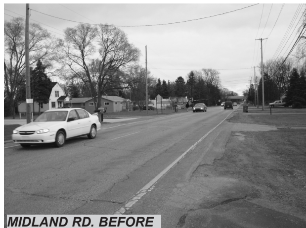
MIDLAND RD. BEFORE